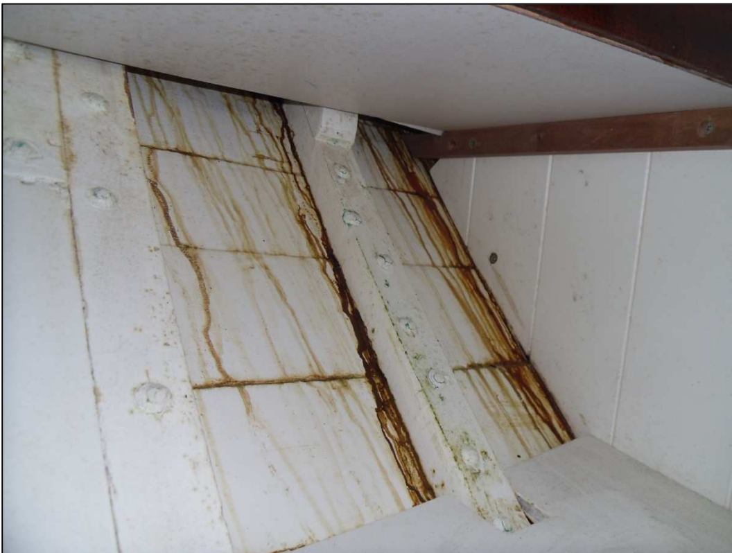
Fig.5 – example of weeping from the structure / planking.

There is a cone anode securely fitted to the end of the propeller.