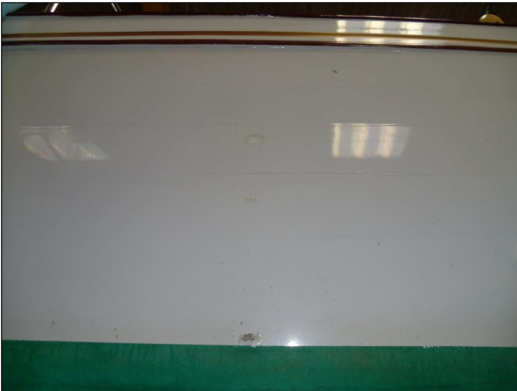
Fig.1 – some light defects and plank caulking line protrusion in the paintwork.

This is in white painted, carvel laid teak planking with a gold painted cove line above the varnished teak fender. The topside is generally clean but there are some areas of paint bubbling / detachment aft of midships as well as some light caulking line protrusion in the paintwork along the yacht's length but there are no signs of any major damage or repair. There are no fore and aft sling tags fitted.