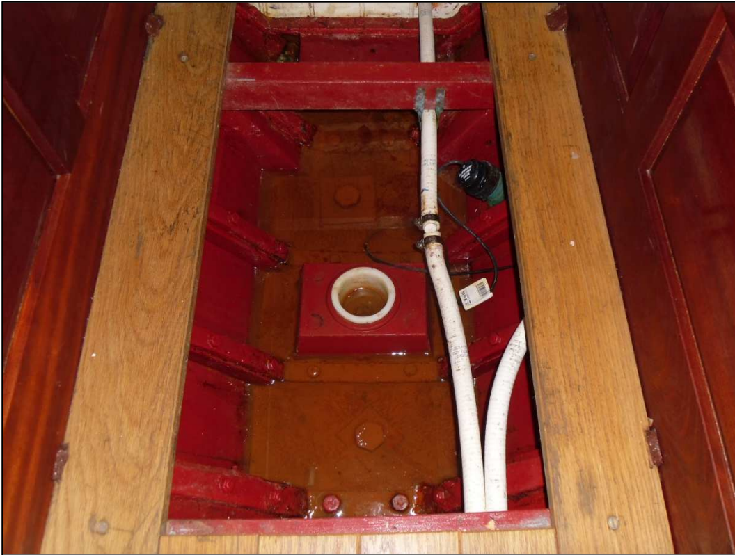
Fig.3 – sea water in the bilge forward covering the keel bolts and iron floors.

The oak frames are in a serviceable condition and securely fitted where seen without any clear signs of separation from the teak planking noted, though some of the copper clench nail heads have patina. There is a leak underneath the water pipework noted around the port side frame under the forward bunk space and there are various leaks and deposits around frame and deck fixings.