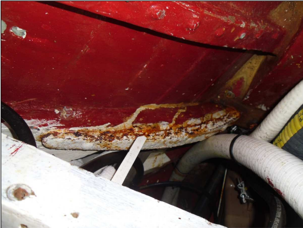
Fig.4 – signs of corrosion and weeping from the lazarette iron floors.

The bulkheads are in marine ply and lined with tongue and groove mahogany securely fitted to the hull and where visible, there are no obvious signs of any movement.