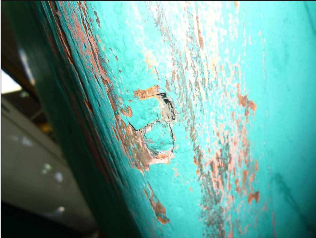
Fig.2 – small area of damage to the bow stem below the waterline.

There are some minor chips and scuffs in the paintwork above the waterline but no signs of any major damage or repair. Below the waterline there is some heavy wear / rubbing, scuffing marks as well as some apparent circular impressions noted with surface wood damage, which may be in way of the connecting bolts. The damp seam / caulking lines can be lightly seen in the antifoul but there are no signs of any obvious internal issues.