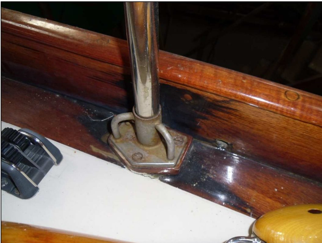
Fig.7 – starboard side gate aft stanchion is loose at the deck join.