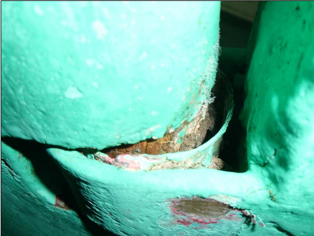
Fig.6 – rudder dudgeon inner sleeve has detached and is corroding.

The rudder is turned directly by a tiller arm located aft of the cockpit and this operated satisfactorily with no signs of any binding.